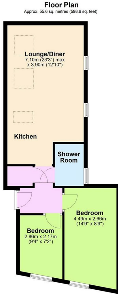
Total area: approx. 55.6 sq. metres (598.6 sq. feet)